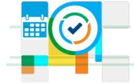
Resource & cost management