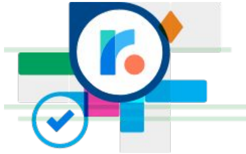
Roadmapping & idea management